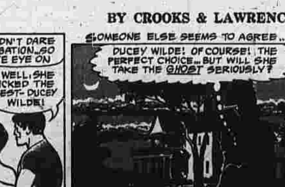
BY CROOKS & LAWRENCE