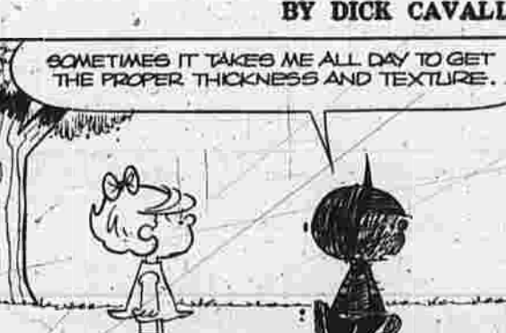
BY DICK CAVALLI