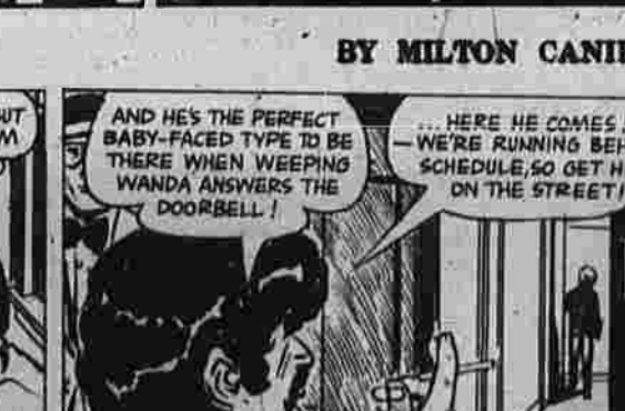
BY MILTON CANIFF